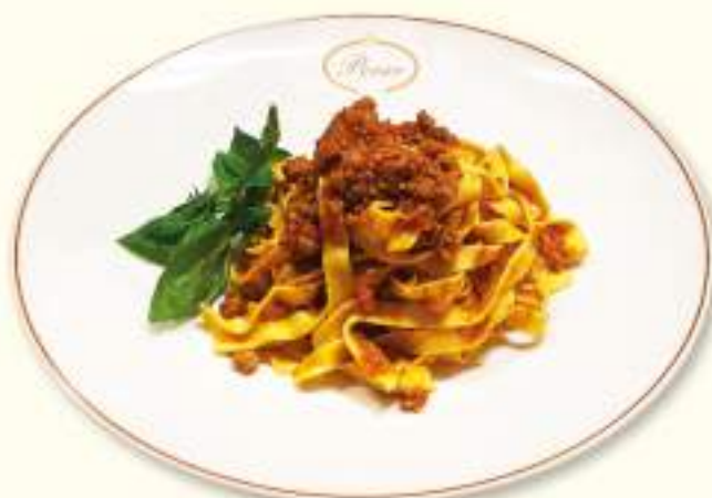
PAPPARDELLE AL RAGU' DI CHIANINA * Pappardelle with Chianina Sauce