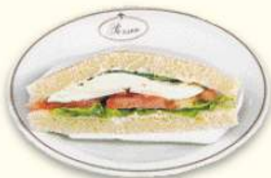
TRAMEZZINO CAPRESE * Sandwich with Fresh Tomato, Mozzarella and Basil