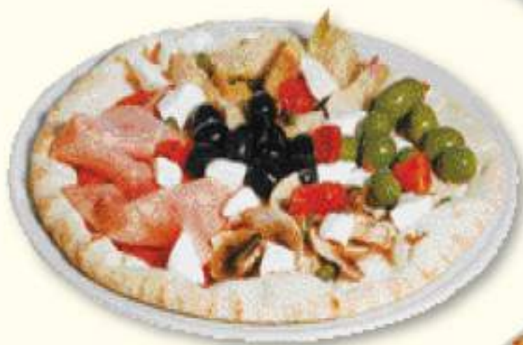
PIZZA 4 STAGIONI * Tomato, Mozzarella, Ham, Olives, Mushrooms, Artichokes