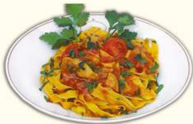
TAGLIATELLE AI FUNGHI * Tagliatelle with Mushrooms Porcini