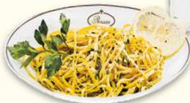
TAGLIERINI AL LIMONE * Taglierini with Lemon Sauce