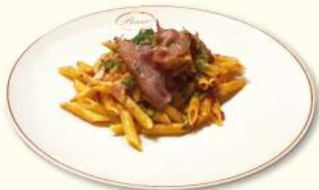
PENNE ALL' AMATRICIANA *