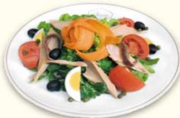
INSALATA NIZZARDA * Potatoes, Tuna Fish, Anchovies, Tomatoes, Capers, Olives