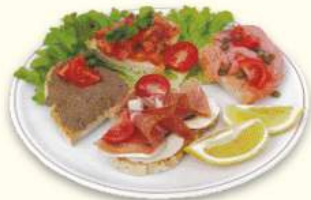
CROSTINI MISTI * Crostini with Ham, Tomato and Liver