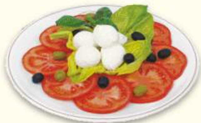
CAPRESE DI BUFALA * Caprese with Bufala Mozzarella