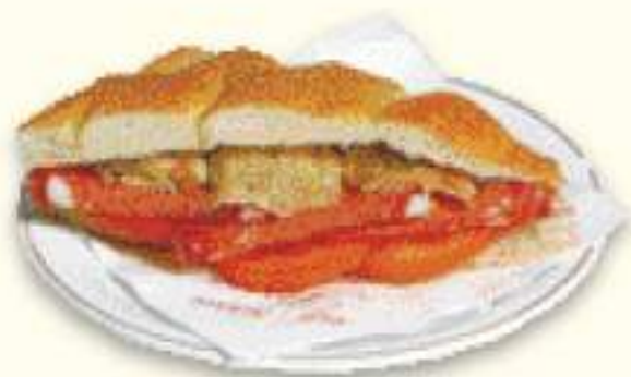
SCHIACCIATA SALAME E CARCIOFI * Salami and Artichokes