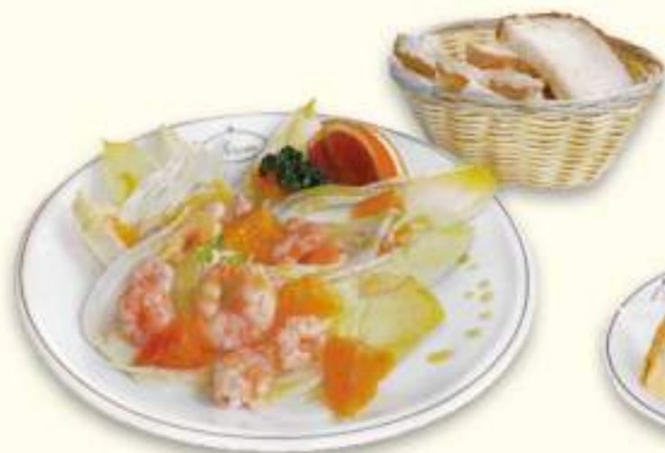
INSALATINA DI GAMBERETTI ALL'ARANCIO * Shrimp and Orange Salad