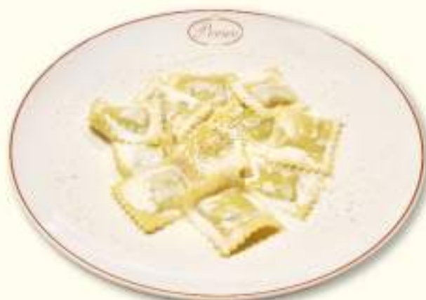
RAVIOLI ALLA CREMA DI