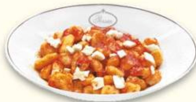
GNOCCHI ALLA SORRENTINA * Gnocchi with Tomatoes and Mozzarella

* CONTIENE ALLERGENI / IT CONTAINS ALLERGENIC