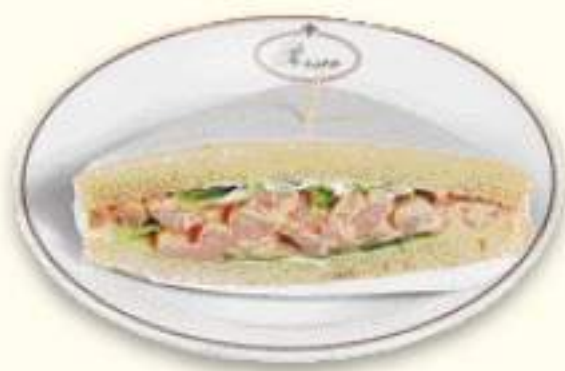
TRAMEZZINO GAMBERETTI * Sandwich with Shrimps and Cocktail Sauce