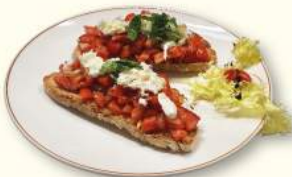
BRUSCHETTA POMODORO E MOZZARELLA * Bruschetta with Tomato and Mozzarella cheese