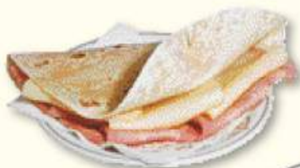
PIADINA * Ham and Fontina