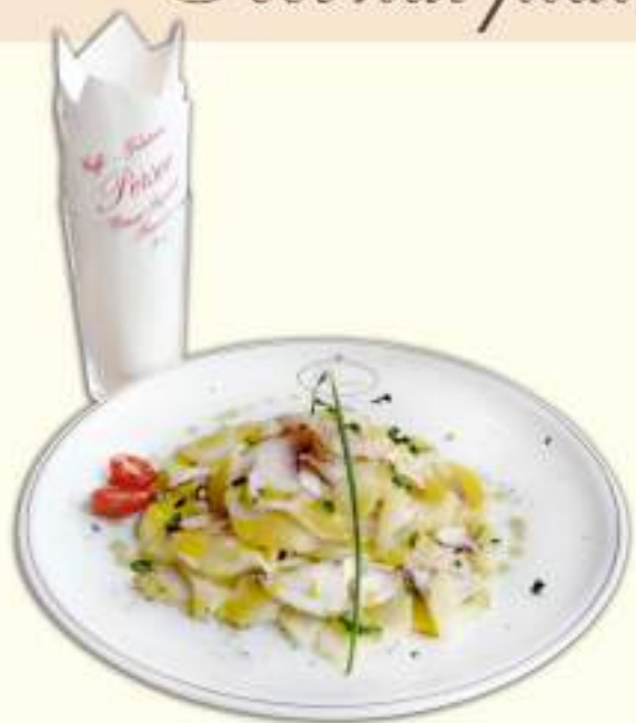
POLPO E PATATE * Octopuss and Potatoes