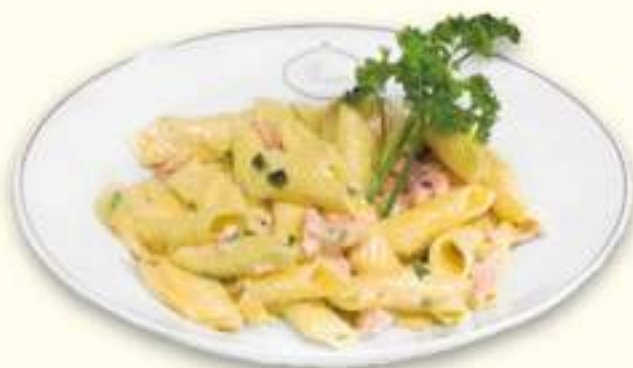
GARGANELLI AL SALMONE * Garganelli with Smoked Salmon