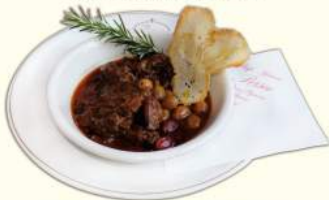
PEPOSO DELL'IMPRUNETA * Peppery Stew