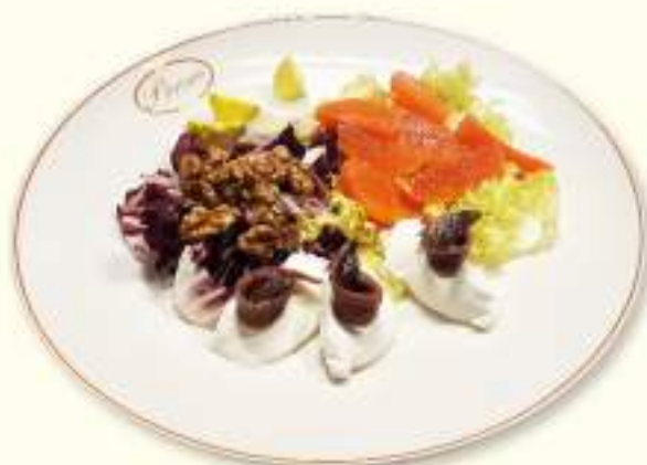
INSALATA MEDITERRANEA * Cheese, Anchovy and Chicory

* CONTIENE ALLERGENI / IT CONTAINS ALLERGENIC