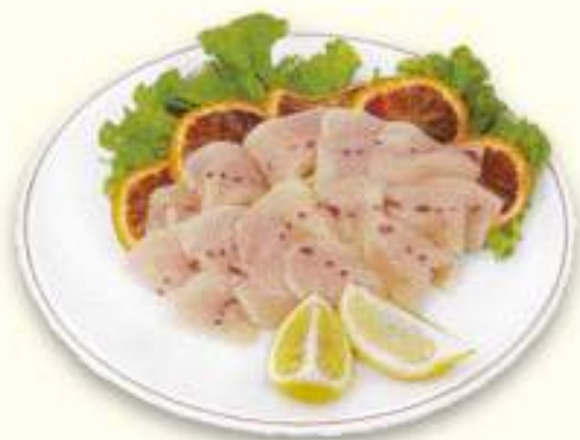
CARPACCIO DI PESCE SPADA * Sword Fish Carpaccio