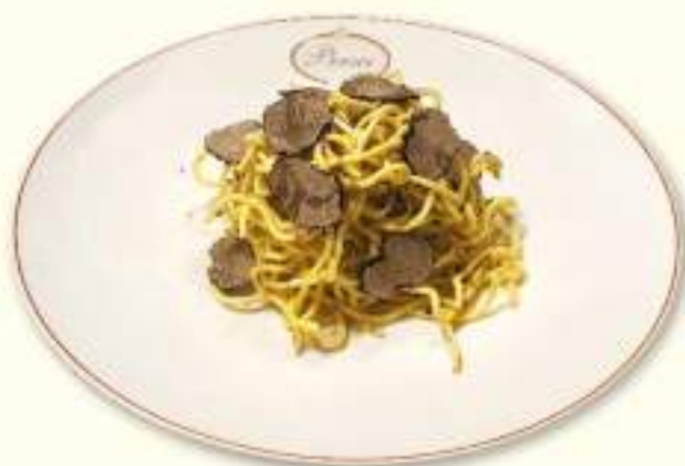
TAGLIERINI AL TARTUFO *