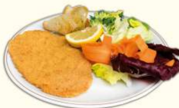
MILANESE DI POLLO CON INSALATA * Fried Chicken Breast with Side Salad

* CONTIENE ALLERGENI / IT CONTAINS ALLERGENIC