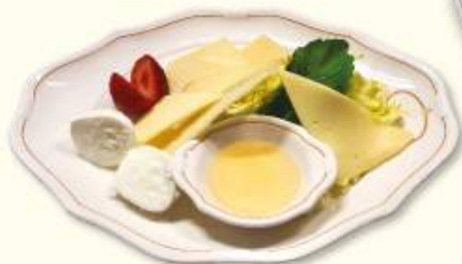
FORMAGGI MISTI * Mixed Cheese

* CONTIENE ALLERGENI / IT CONTAINS ALLERGENIC