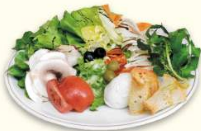
INSALATA VEGETARIANA * Vegetables Mixed Salad