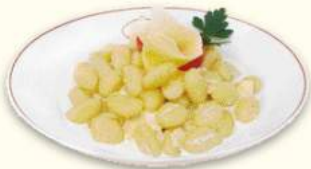
GNOCCHI AI 4 FORMAGGI * Gnocchi with 4 Cheese Sauce