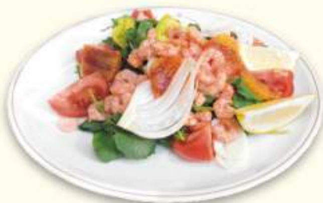
INSALATA DI GAMBERETTI * Shrimp, Arugula and Tomatoes