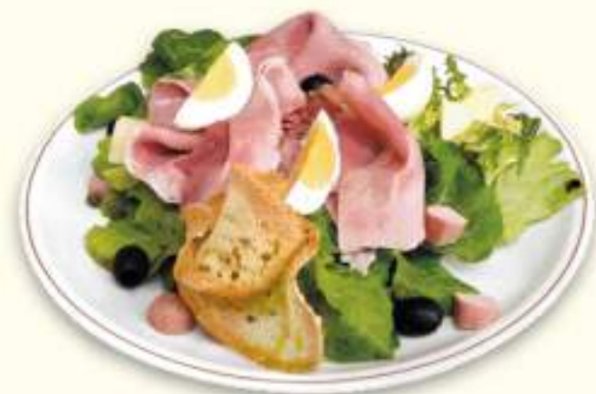
INSALATA AUSTRIACA * Endive Lettuce, Ham, Egg, Olives and Cheese