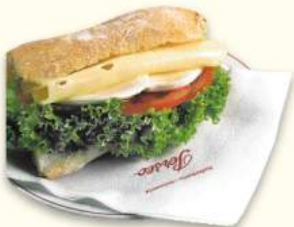
PANINO TIPO VEGETARIANO * Fontina, Tomato, Indive, Lettuce and Mozzarella