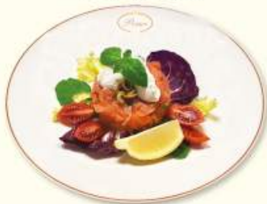
TARTARE DI SALMONE AFFUMICATO * Smoked Salmon Tartare