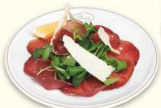
CARPACCIO DI BRESAOLA * Bresaola with Flaked Parmesan Cheese and Arugula