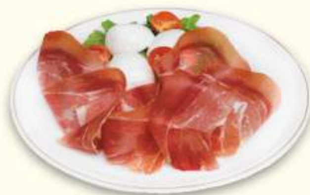
PROSCIUTTO E MOZZARELLA * Ham and Mozzarella