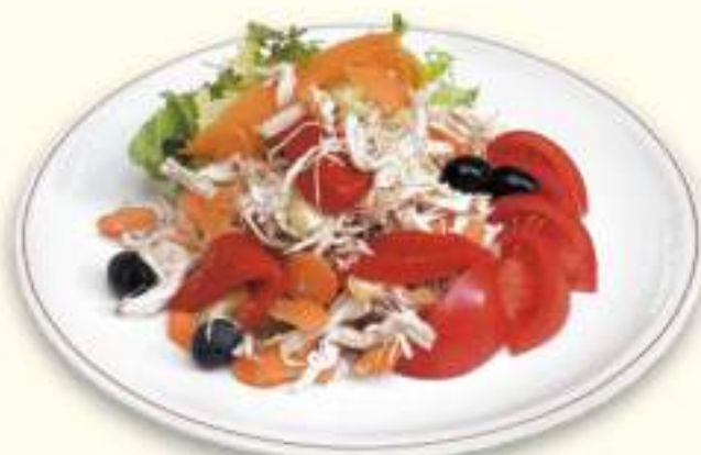
INSALATA DI POLLO * Chicken Salad