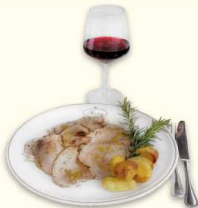
ARISTA ARROSTO CON PATATE * Roast Veal with Potatoes