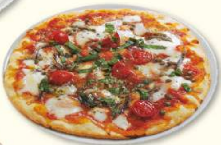
PIZZA NAPOLI * Tomato, Mozzarella, Anchovy, Capers