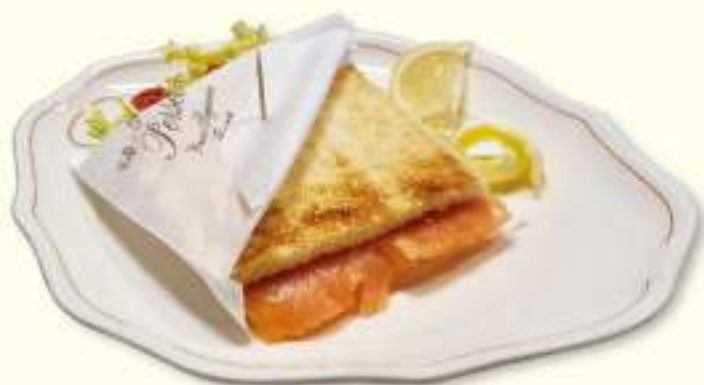
TOAST SALMONE * Butter and Smoked Salmon