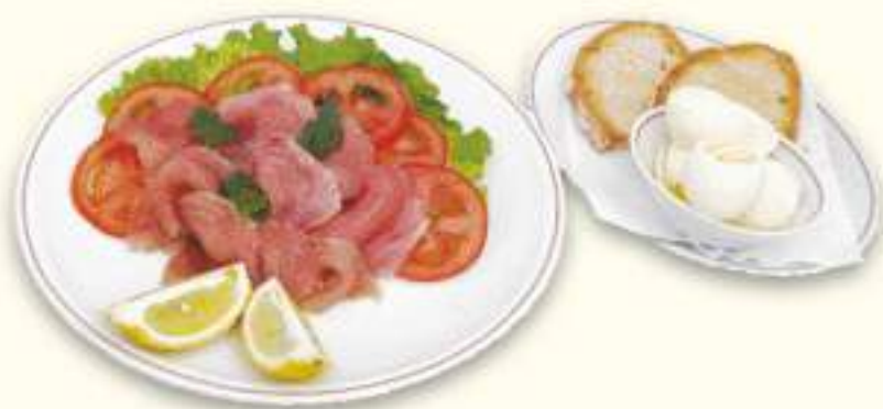
CARPACCIO DI TONNO * Tuna Fish Carpaccio