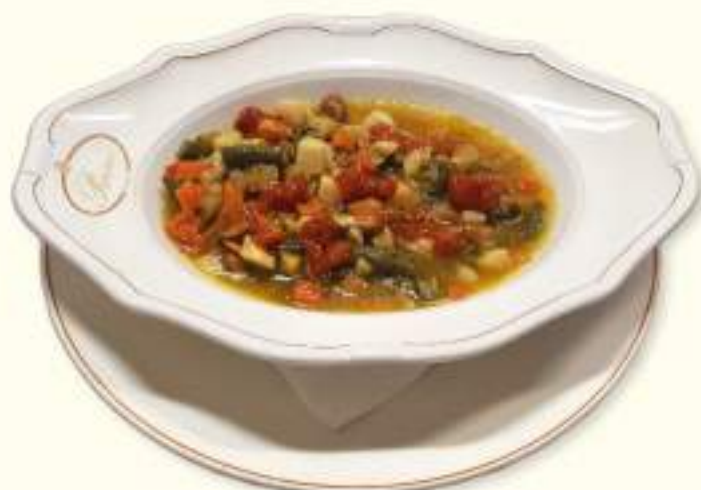
MINISTRONE * Minestrone Vegetables