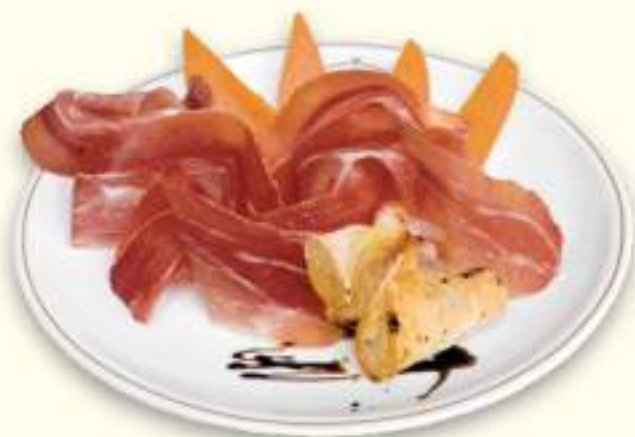
PROSCIUTTO E MELONE * Ham and Melon