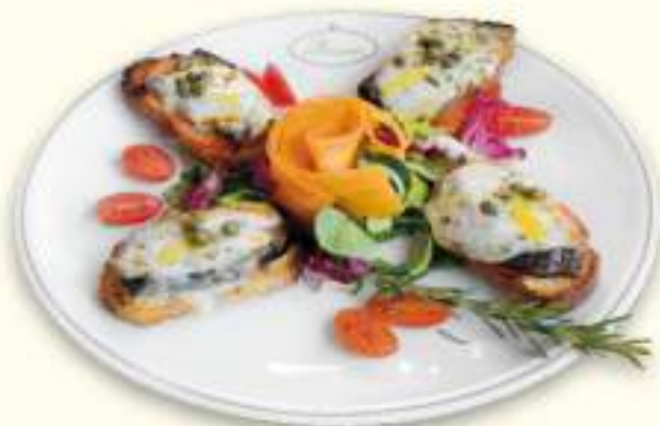
CROSTINI POMODORO MELANZANE MOZZARELLA E CAPPERI * Crostini with Mozzarella, Tomato, Eggplant and Capers

* CONTIENE ALLERGENI / IT CONTAINS ALLERGENIC