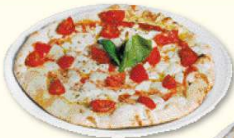
PIZZA MARGHERITA * Tomato and Mozzarella