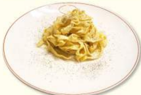
TAGLIATELLE CACIO E PEPE *