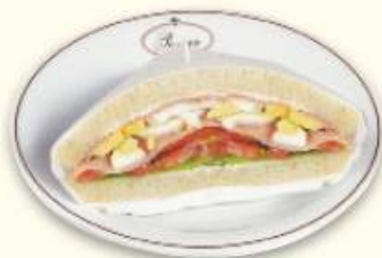
TRAMEZZINO PROSCIUTTO * Sandwich with Ham, Tomato, and Eggs