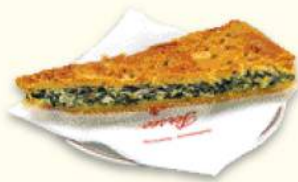
SFORMATO SPINACI E RICOTTA * Spinach and Ricotta

* CONTIENE ALLERGENI / IT CONTAINS ALLERGENIC