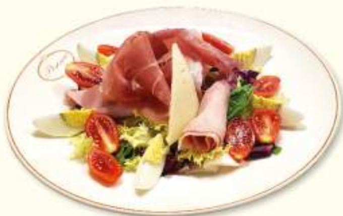
INSALATA PRIMAVERA * Ham, Tomatoes, Eggs and Cheese