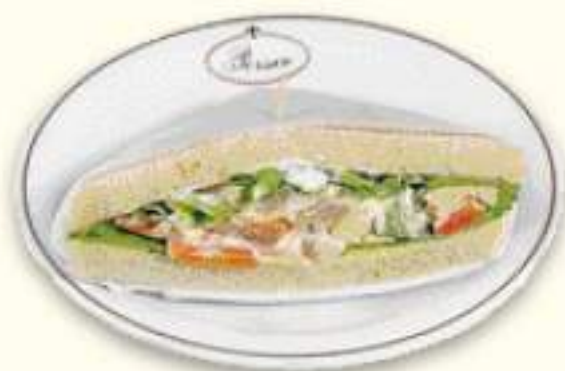
TRAMEZZINO POLLO * Sandwich with Chiken Salad