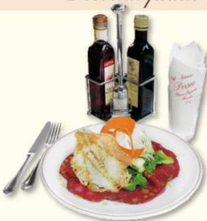
CARPACCIO DI MANZO * Beef Carpaccio