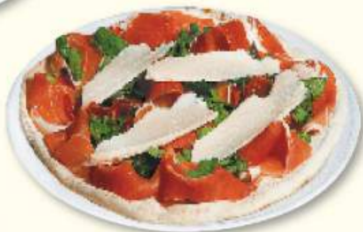
COVACCINO PROSCIUTTO E PARMIGIANO * Cured Ham and Parmesan Cheese