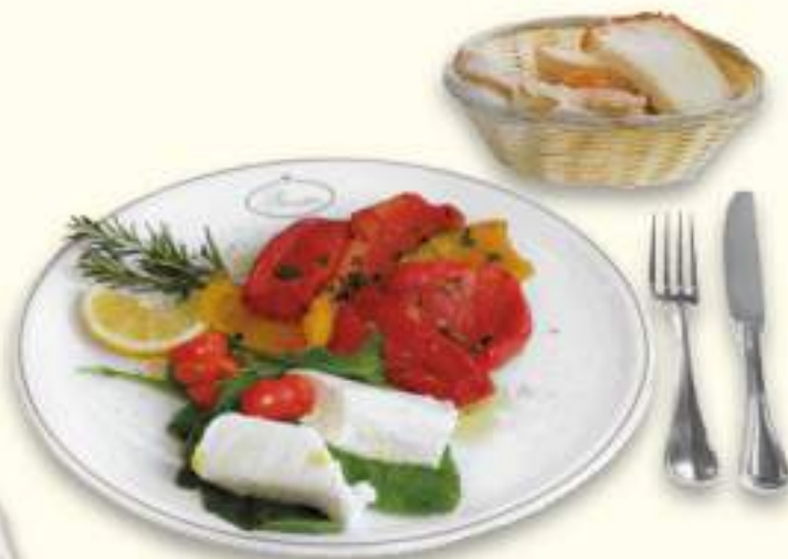
PEPERONI GRIGLIATI E FORMAGGIO CAPRINO * Grilled Pepper and Goat's Cheese