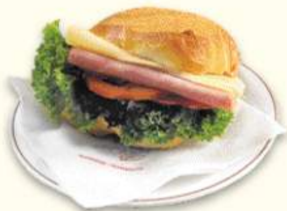
PANINO COTTO E FONTINA * Ham, Fontina, Indive, Lettuce and Tomato