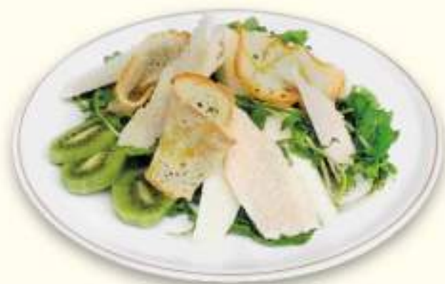
INSALATA PERE PARMIGIANO E RUCOLA * Pears, Parmesan Cheese, Rucola and Kiwi