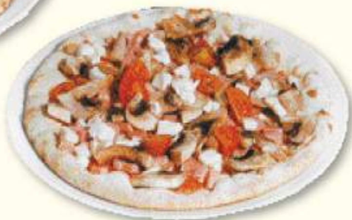
PIZZA CAPRICCIOSA * Tomato, Mushrooms, Ham, Mozzarella