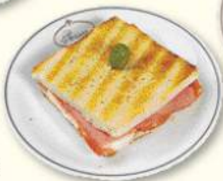
TOAST FARCITO * Tomato, Ham, Mozzarella