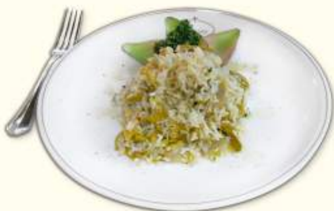
RISOTTO AI CARCIOFI *