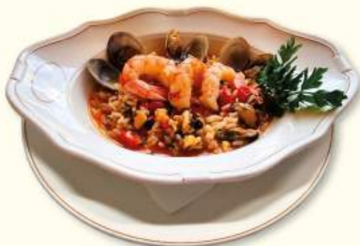
RISO MARE * Risotto with Seafoods

* CONTIENE ALLERGENI / IT CONTAINS ALLERGENIC