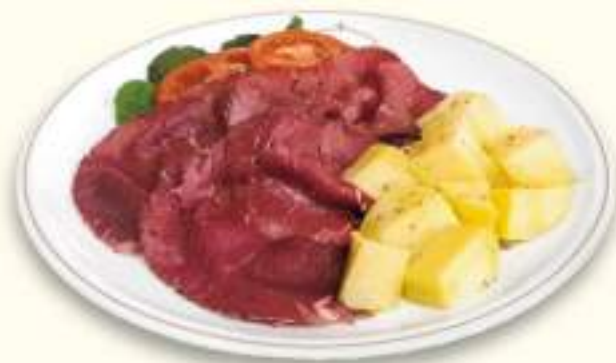
ROAST BEEF CON PATATE * Roast beef with Potatoes