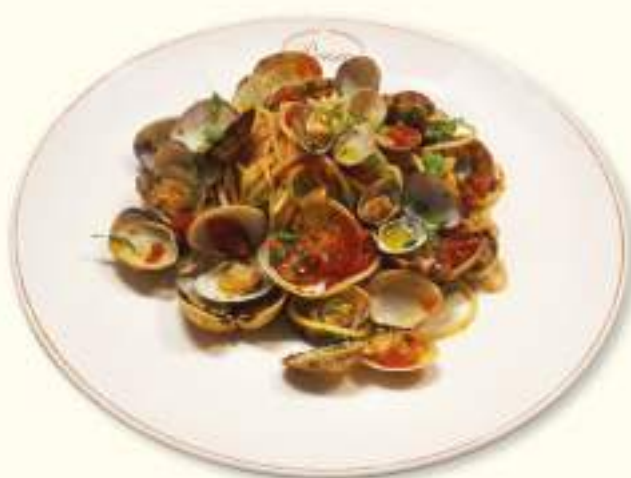
SPAGHETTI ALLE VONGOLE * Spaghetti with Clams and Tomato