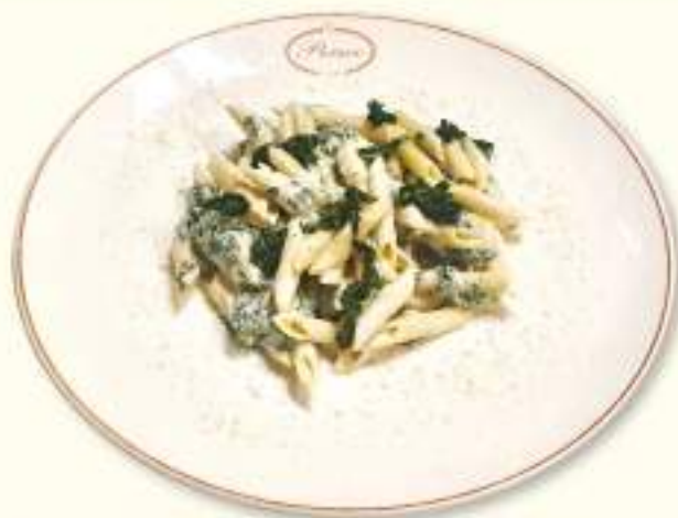
PENNE ALLA CREMA DI SPINACI * Penne with Cream Cheese and Spinach