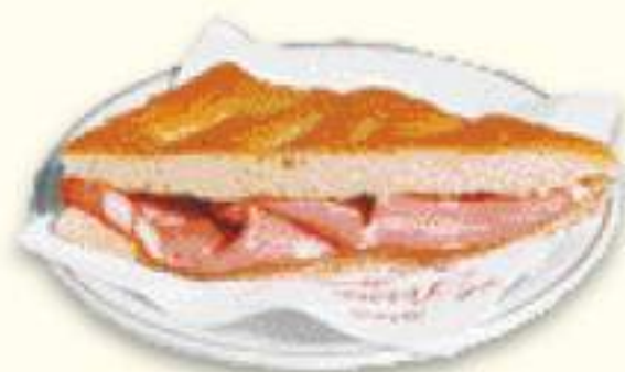
SCHIACCIATA MORTADELLA * Mortadella