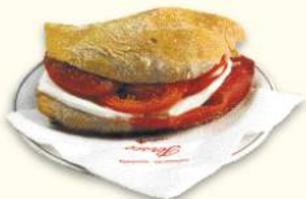
PANINO CRUDO E MOZZARELLA * Cured Ham, Tomato, Mozzarella