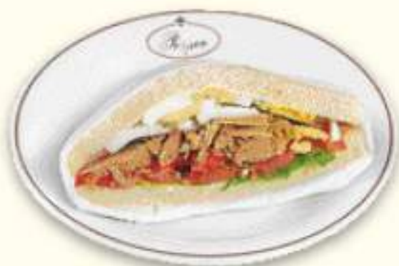
TRAMEZZINO TONNO * Sandwich with Tuna Fish, Tomato and Eggs

* CONTIENE ALLERGENI / IT CONTAINS ALLERGENIC