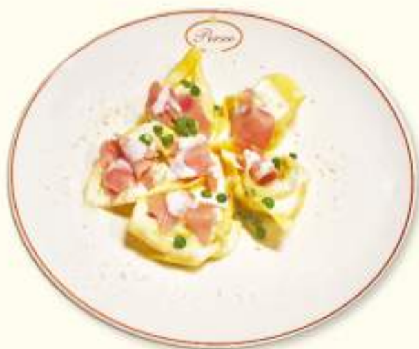
TORTELLONI PANNA PROSCIUTTO E PISELLI * Tortelloni with Cream, Ham and Peas