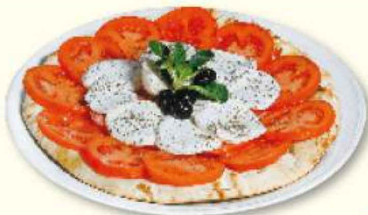
COVACCINO, MOZZARELLA E POMODORO * Bufala Mozzarella and Tomatoes