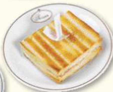
TOAST * Ham and Fontina