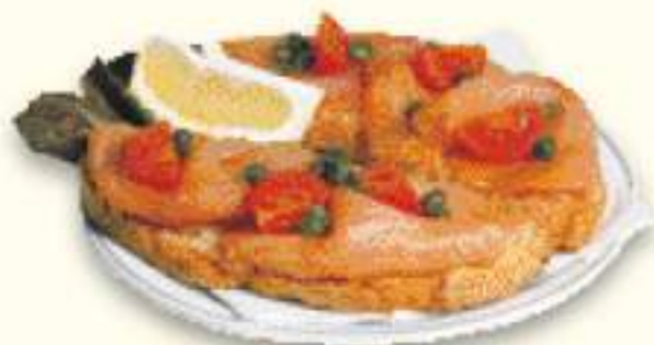
BRUSCHETTA SALMONE * Bruschetta with Smoked Salmon