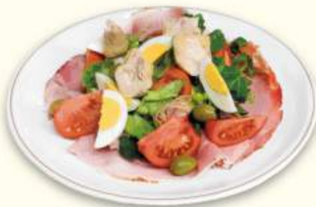
INSALATA GIACOMINA * Eggs, Roast Ham, Artichokes, Olives and Tomato

* CONTIENE ALLERGENI / IT CONTAINS ALLERGENIC