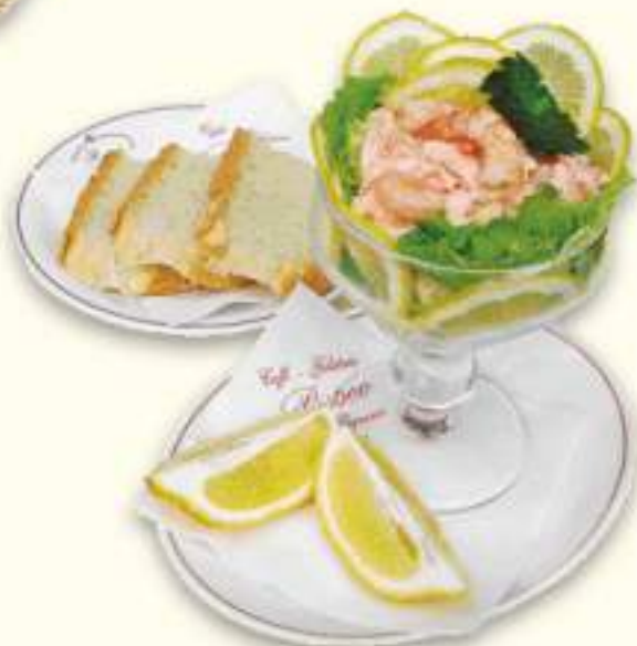
COCKTAIL GAMBERETTI * Shrimp Cocktail