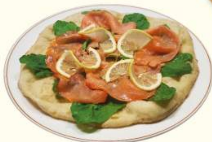
COVACCINO AL SALMONE * Salmon, Arugula

* CONTIENE ALLERGENI / IT CONTAINS ALLERGENIC