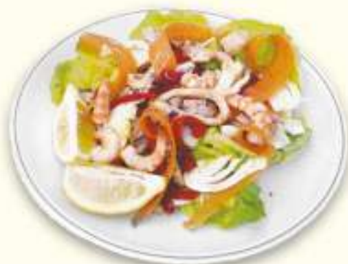
INSALATA DI MARE CALDO * Warm Seafood Salad