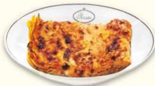
LASAGNE AL FORNO * Lasagne