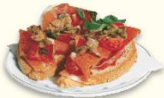
BRUSCHETTA POMODORO E PROSCIUTTO * Bruschetta with Ham and Tomato