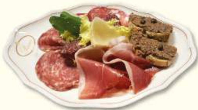
ANTIPASTO PERSEO * Assortment of Cured Pork and crostini with liver